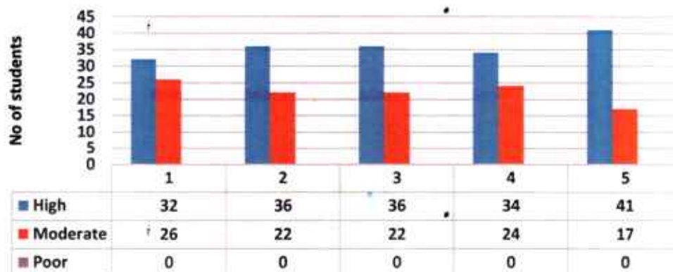
Feedback on curriculum/syllabus A.Y:2022-23 Alumni Feedback Report