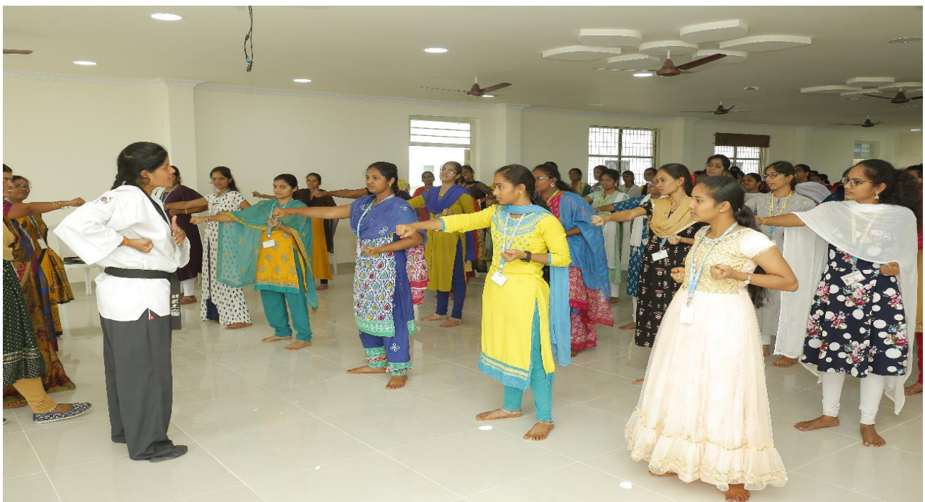
Few Captured Pictures on the Programme: