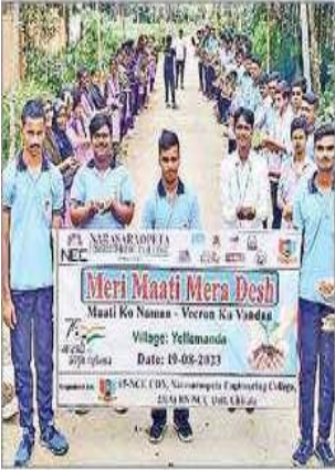
ప్రదర్శనలో ఎన్సీసీ విద్యార్థులు