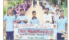
ర్యాలీలో పాల్గొన్న ఎన్సీసీ క్యాడెట్స్, విద్యార్థులు