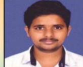
G. S. S. SUGNAN 21475A0327 8.09