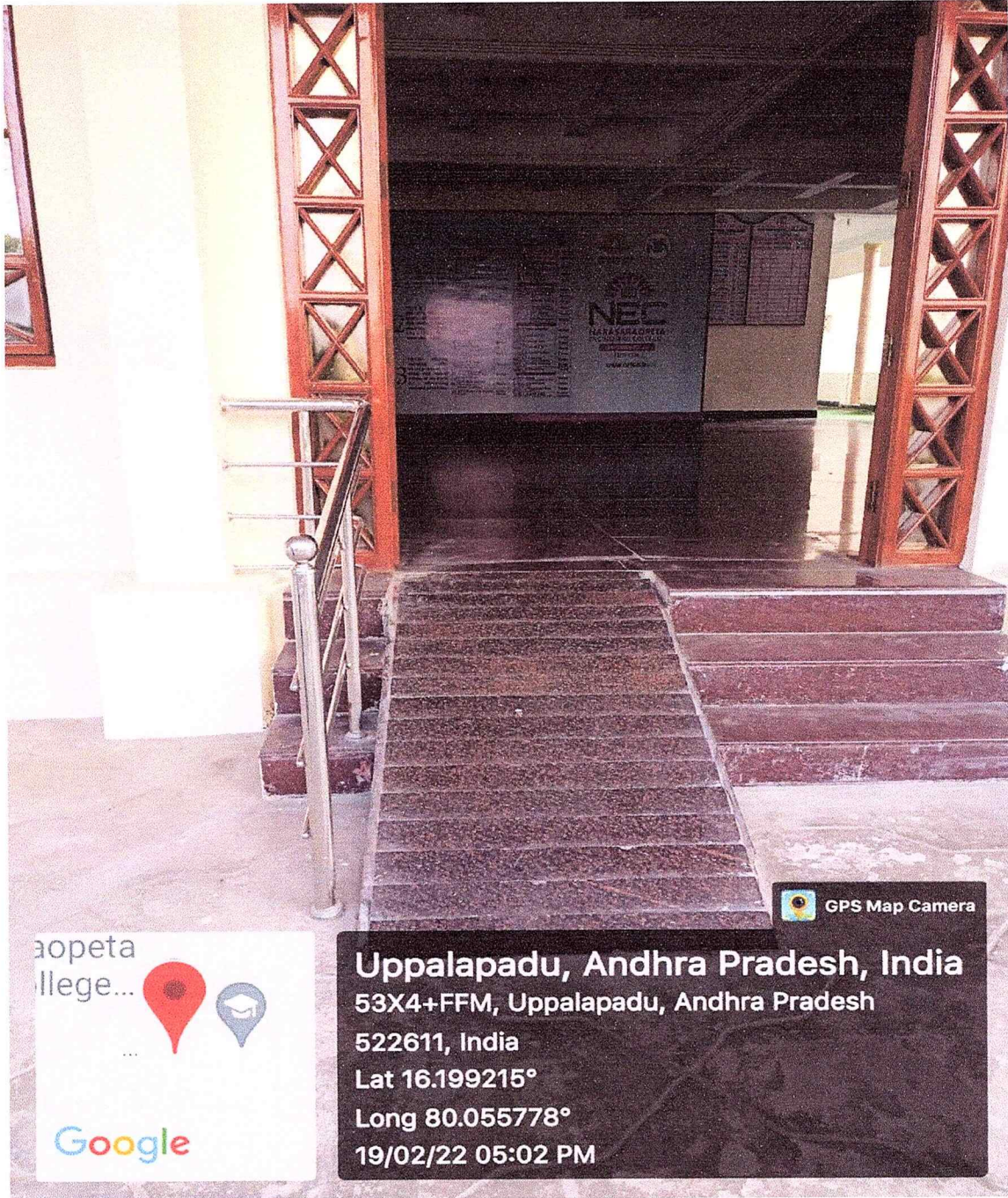
BLOCK 2 ENTRANCE